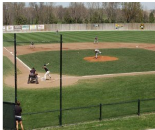
Pete Chapman Baseball Complex

A lot of success can be shown on the field, with a winning tradition prevalent in many winning seasons. However, the baseball team takes pride in more than just winning. The WSC Baseball team also understands the importance of performing well in the classroom. The team GPA is around 3.25 and among that, 9 players recently received the all-academic conference team this past Spring of 2018.